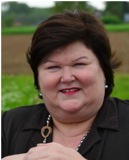
Dr. Maggie De Block Former Minister of Social Affairs and Public Health, and Asylum and Migration Member of Parliament BELGIUM

global leadership role that The Netherlands has played in this respect. On the national level, this includes multi-sectoral cooperation and stakeholder engagement on the One Health National Action Plan. On the global level, The Netherlands organized the first One Health ministerial conference on AMR to provide political support for the development of the AMR Global Action Plan of 2015 and the UN political resolution of 2016. In 2019, The Netherlands organized the second One Health ministerial conference. An important outcome of the conference was the launch of the Multi Partner Trust Fund on AMR to support countries to design and implement National Action plans. Ms. Van Ark received her degree in Public Administration from Erasmus University of Rotterdam.