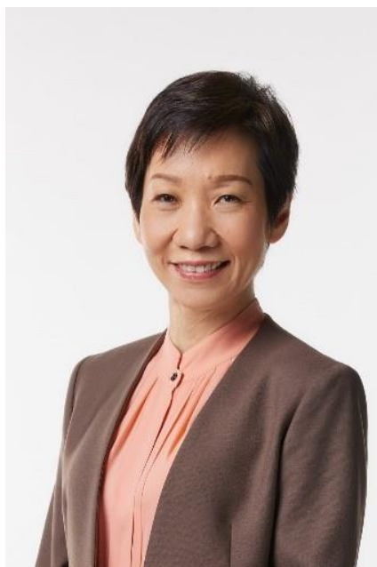
Ms. Grace Fu Minister for Sustainability and the Environment Member of Parliament SINGAPORE

Mr. Kenneth C. Frazier has served as the Chairman of the Board and Chief Executive Officer of Merck & Co., Inc., Kenilworth, NJ, USA, known as MSD outside of the U.S. and Canada, since 2011. He has led the company in delivering lifesaving medicines, as well as forming philanthropic initiatives, after first joining Merck in 1992 and serving as General Counsel and President. Along with more than 20 companies, Merck has invested in the AMR Action Fund under his leadership. The Fund has been set up to support the development of novel antibiotics and public policy reforms necessary to create a sustainable innovation ecosystem. Mr. Frazier is committed to driving innovation in the pharmaceutical industry to face the urgent global health threat of AMR and address patient and societal needs. He is widely recognized for his expertise in legal, business and humanitarian fields. He sits on the boards of Catalyst, PhRMA, Weill Cornell Medicine, Exxon Mobil Corporation, and Cornerstone Christian Academy in Philadelphia, PA, and is a member of the American Academy of Arts and Sciences, the American Philosophical Society, the American Bar Association, the Business Council, and the Council of the American Law Institute. Mr. Frazier holds a J.D. degree from Harvard Law School.