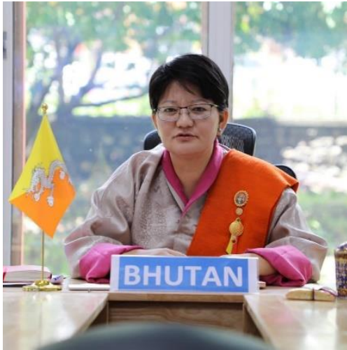
Ms. Dechen Wangmo Minister of Health BHUTAN

Ms. Wangmo is the Minister of Health of Bhutan. She is a public health expert and consultant with over 10 years of experience working in policy review and formulation, grant proposal development and strategic planning for governments and civil society. Her primary focus has been on monitoring and evaluation systems with an emphasis on reproductive and sexual health, HIV and AIDS and community health systems. She brings her background working on various global health issues including gender inequality and water and sanitation to