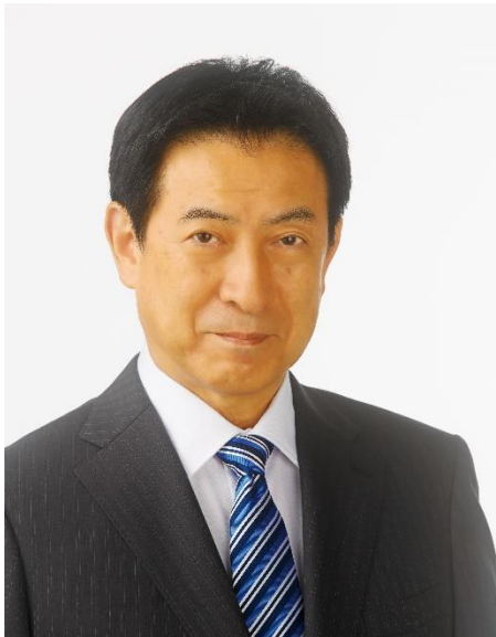
Mr. Yasuhisa Shiozaki Former Minister of Health, Labour and Welfare Member of the House of Representatives JAPAN

authored over 70 scientific articles and over 50 regulatory and procedural documents. During the Ebola crisis in Africa, she organized the deployment of Rospotrebnadzor specialists in Guinea. She initiated the joint project between Rospotrebnadzor and FAO aimed at AMR prevention in the countries of Eurasian Economic Union and Tajikistan, which would result in training specialists from countries in Central Asia and strengthening their monitoring systems and national laboratories. Prof. Popova is currently Deputy Head of the operational headquarters for addressing COVID-19 in Russia. She received her Ph.D. from Rostov State Medical University.