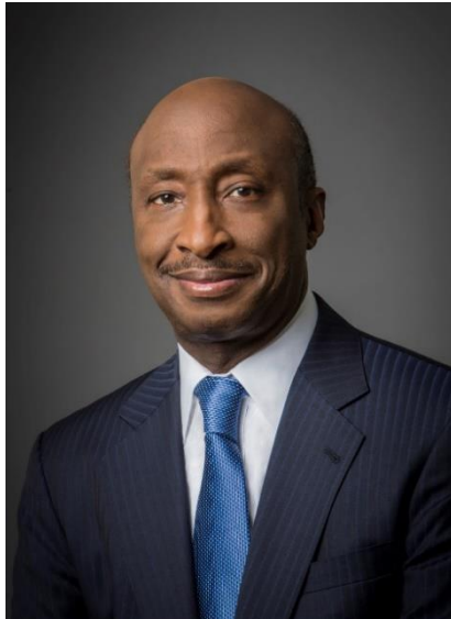
Mr. Kenneth C. Frazier Chairman of the Board and Chief Executive Officer Merck & Co., Inc., Kenilworth, NJ UNITED STATES OF AMERICA

Mr. Kenneth C. Frazier has served as the Chairman of the Board and Chief Executive Officer of Merck & Co., Inc., Kenilworth, NJ, USA, known as MSD outside of the U.S. and Canada, since 2011. He has led the company in delivering lifesaving medicines, as well as forming philanthropic initiatives, after first joining Merck in 1992 and serving as General Counsel and President. Along with more than 20 companies, Merck has invested in the AMR Action Fund under his leadership. The Fund has been set up to support the development of novel antibiotics and public policy reforms necessary to create a sustainable innovation ecosystem. Mr. Frazier is committed to driving innovation in the pharmaceutical industry to face the urgent global health threat of AMR and address patient and societal needs. He is widely recognized for his expertise in legal, business and humanitarian fields. He sits on the boards of Catalyst, PhRMA, Weill Cornell Medicine, Exxon Mobil Corporation, and Cornerstone Christian Academy in Philadelphia, PA, and is a member of the American Academy of Arts and Sciences, the American Philosophical Society, the American Bar Association, the Business Council, and the Council of the American Law Institute. Mr. Frazier holds a J.D. degree from Harvard Law School.