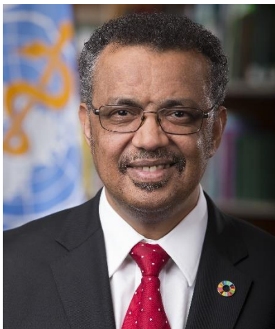
Dr. Tedros Adhanom Ghebreyesus Director-General World Health Organization