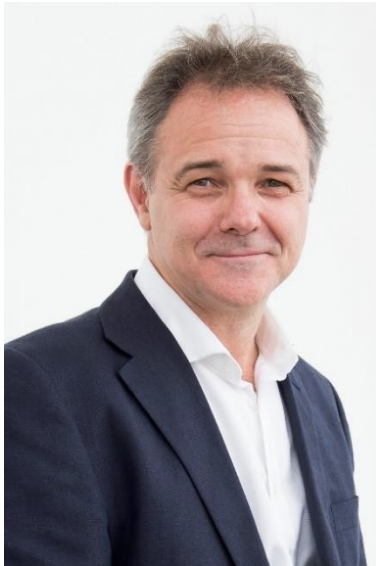
Prof. Sir Jeremy James Farrar Director Wellcome Trust UNITED KINGDOM

Prof. Sir Jeremy Farrar is the Director of the Wellcome Trust. Under his leadership, Wellcome has established AMR as a central priority for research funding and advocacy activities. He has been a long-standing advocate for action on AMR, with a focus on supporting these activities in resource-limited settings. He is a member of the UK Government's COVID-19 Vaccine Task Force, the UK Scientific Advisory Group for Emergencies, and the Joint World Bank/WHO Global Preparedness Monitoring Board. Jeremy has been engaged in global health research for many years, collaborating across sectors and playing a leading role in the responses to the 2014 Ebola outbreak and the global COVID-19 pandemic. He was previously Professor of Tropical Medicine and Global Health at the University of Oxford and Director of the Clinical Research Unit at the Hospital for Tropical Diseases in Ho Chi Minh City, Viet Nam. He graduated in medicine from the University College London Medical School and a Ph.D. from the University of Oxford.