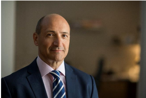
Dr. Christopher Fearné Deputy Prime Minister and Minister for Health Member of Parliament MALTA

Dr. Fearné is Deputy Prime Minister and Minister for Health of Malta and has been a Member of Parliament since 2013. He is a pediatric surgeon with extensive research and teaching experience, including as Clinical Chairman for Surgery at Mater Dei Hospital in Malta. He has worked to bring AMR to the national and international agenda, including developing Malta's first National Strategy on AMR for 2020-2028. He was the President of the European Union Council of Ministers of Health during Malta's Presidency in the European Union in 2017 and spearheaded the setting up of the Valetta Declaration for the joint collaboration for the procurement and development of new drugs. He graduated with a degree in Medicine and Surgery from the University of Malta.