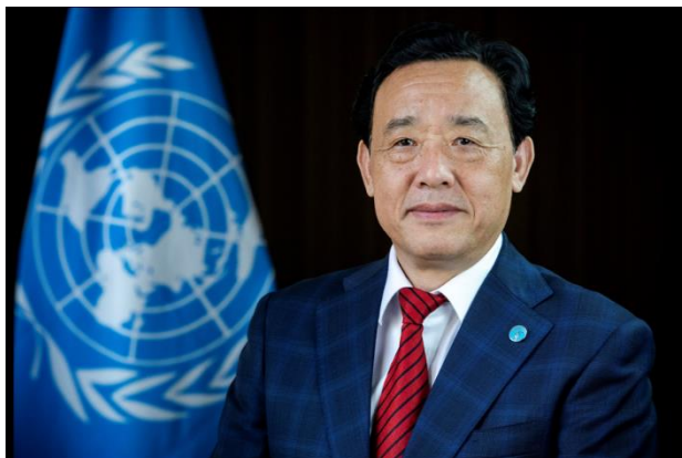
Dr. Qu Dongyu Director-General Food and Agriculture Organization

Qu Dongyu, who took office on 1 August 2019 as Director-General of the Food and Agriculture Organization of the United Nations, has spent his life working on how to make sure the world is fed.