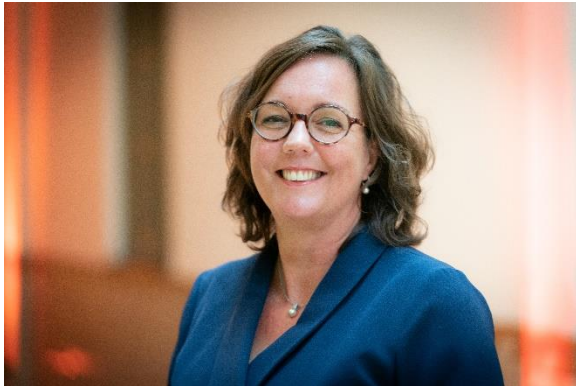
Ms. Tamara van Ark Minister for Medical Care and Sport THE NETHERLANDS

Ms. Van Ark is the Minister for Medical Care and Sport of The Netherlands. She previously served as a State Secretary for Social Affairs and Employment and as a Member of Parliament. She believes in the need for strong leadership and international cooperation in the fight against AMR and is committed to continuing the