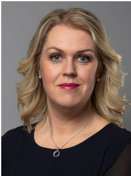
Ms. Lena Hallengren Minister for Health and Social Affairs SWEDEN

Ms. Hallengren is a Minister for Health and Social Affairs in Sweden. Her responsibilities include health care, public health, disabilities and social services including care for older people. During the previous administration, Ms. Hallengren held the position of Minister for Children, the Elderly and Gender Equality. She has had numerous assignments as member of the Swedish Parliament, the Riksdag, such as Deputy Chair in the Committee on Health and Welfare and Chair in the Committee on Education. She has extensive experience in management and general administration and has advocated for multi-stakeholder engagement, working to include AMR in investments and for a One Health approach. She has championed AMR both nationally and within the UN system and co-chairs the ministerial group Alliance of Champions on Antimicrobial Resistance. Ms. Hallengren received her Bachelor degree in Education from Kalmar University in Sweden.