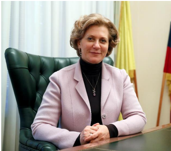
Prof. Anna Y. Popova Head of the Federal Service for Surveillance on Consumer Rights Protection and Human Well-being (Rospotrebnadzor) Chief Sanitary Physician of the Russian Federation RUSSIAN FEDERATION

Prof. Popova is the Head of the Federal Service for Surveillance on Consumer Rights Protection and Human Well-being (Rospotrebnadzor) and Chief State Sanitary Physician of the Russian Federation. Prof. Popova is an expert epidemiologist with specialties in hygiene, evaluation of health risks and hygienic safety. She has