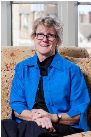
Prof. Dame Sally Davies UK Special Envoy on Antimicrobial Resistance UNITED KINGDOM