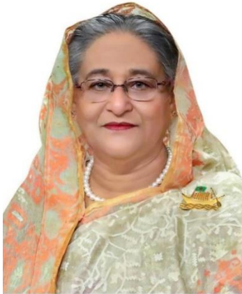
H.E. Sheikh Hasina Prime Minister PEOPLE'S REPUBLIC OF BANGLADESH

Sheikh Hasina is the Prime Minister of the Government of the People's Republic of Bangladesh, assumed the office in January 2019 for the fourth time.