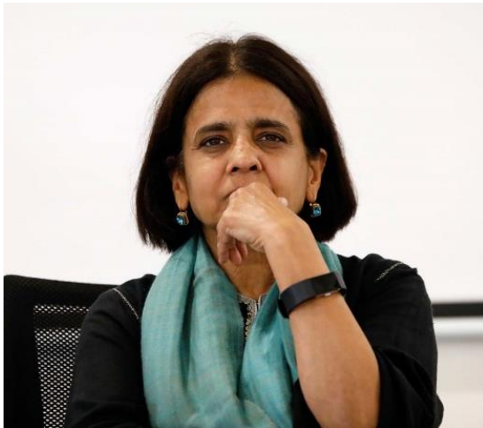
Ms. Sunita Narain Director-General Centre for Science and Environment INDIA

Ms. Narain is the Director-General of Centre for Science and Environment and was a member of the UN Interagency Coordination Group on AMR. She is an environmentalist and author, playing an active role in policy formulation on issues of environment and development in India and globally. Her work with the Centre for Science and Environment on AMR issues is focused on the land and food connection of antimicrobials through environment, agriculture and livestock pathways. She was a member of the Indian Prime Minister's Council on Climate Change and has been awarded the Padma Shri, the fourth highest civilian honour. In 2005, the Centre for Science and Environment, under her leadership was also awarded the Stockholm Water Prize. In 2016, Time Magazine listed her as one of the 100 most influential people in the world.