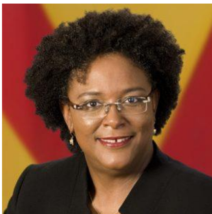
H.E. Mia Amor Mottley Prime Minister Minister of Finance, Economic Affairs and Investment Minister of National Security and the Civil Service BARBADOS

H.E. Sheikh Hasina believes in democracy, secularism, inclusive growth and progress, and dedicated her life to eliminate poverty and barriers that marginalize people.