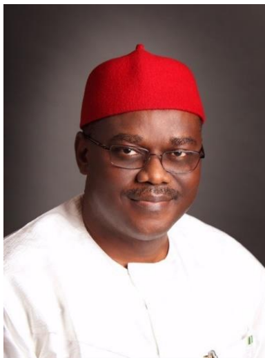
Prof. C. O. Onyebuchi Chukwu Former Minister of Health Professor of Orthopaedic Surgery Alex Ekwueme Federal University Ndufu Alike NIGERIA

Prof. Campos served as Minister of Health in Portugal from 2001-2002 and from 2005-2008. He is currently Professor Emeritus at the National School of Public Health at the New University of Lisbon. He was a Member of the European Parliament and one of the co-builders of the Portuguese National Health Service. Prof. Campos authored numerous books and articles on health care, health economics, health policy and public administration services. As a trained health economist and health politician, he is deeply concerned with the social and economic implications of healthcare associated infections to individuals and society. He received his degree in Law by the University of Coimbra, Directeur d'Hôpital by the École Nationale de la Santé Publique de Rennes, and Master of Public Health from The Johns Hopkins University.