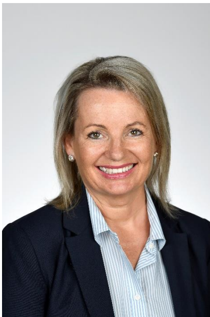
Ms. Sussan Ley Minister for the Environment Department of Agriculture, Water and the Environment Member of Parliament AUSTRALIA

Ms. Hallengren is a Minister for Health and Social Affairs in Sweden. Her responsibilities include health care, public health, disabilities and social services including care for older people. During the previous administration, Ms. Hallengren held the position of Minister for Children, the Elderly and Gender Equality. She has had numerous assignments as member of the Swedish Parliament, the Riksdag, such as Deputy Chair in the Committee on Health and Welfare and Chair in the Committee on Education. She has extensive experience in management and general administration and has advocated for multi-stakeholder engagement, working to include AMR in investments and for a One Health approach. She has championed AMR both nationally and within the UN system and co-chairs the ministerial group Alliance of Champions on Antimicrobial Resistance. Ms. Hallengren received her Bachelor degree in Education from Kalmar University in Sweden.