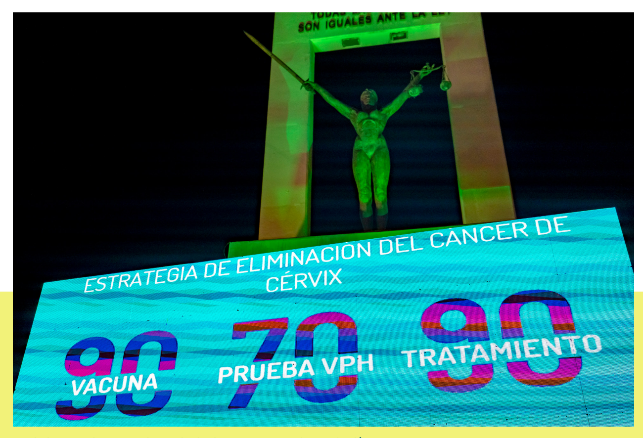
Cervical cancer advocates gather at El Salvador's Monumento a la Constitución.

WHO's Call to Action to eliminate cervical cancer gave momentum to El Salvador's efforts, which date back to 2008. Today, El Salvador has potential to become the first country in Central America that could reach the elimination targets.