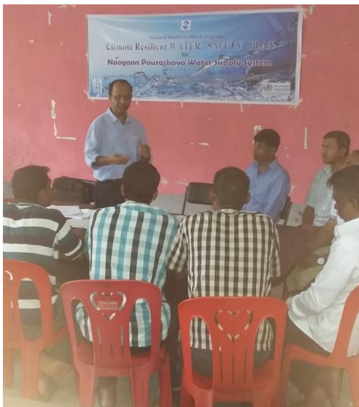
Figure 3: Discussion with Pourashava water supply section staff