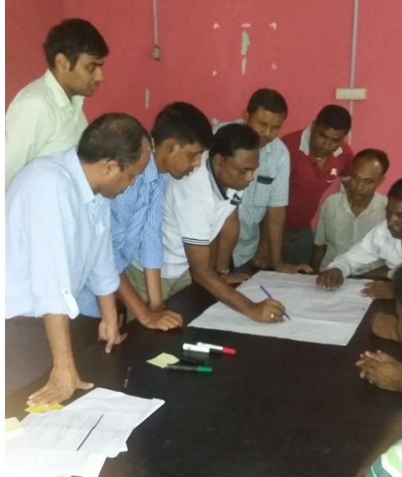
Figure 4: Group work during hazard analysis workshop in Naogaon Pourashava