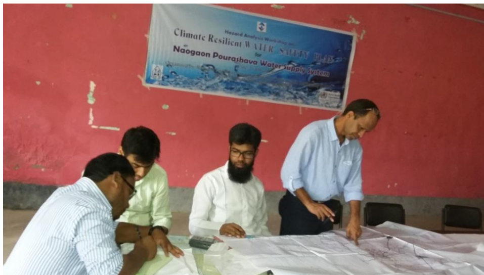
Figure 2: Hazard analysis workshop in Naogaon Pourashava