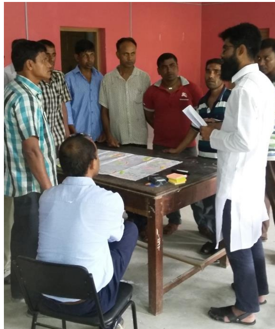
Figure 5: Group discussion during hazard analysis workshop in Naogaon Pourashava