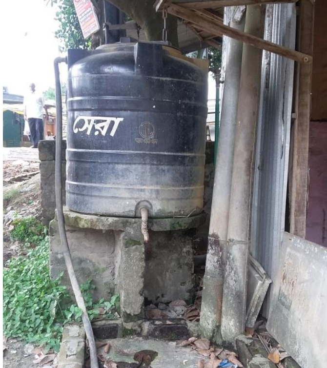
Figure 4: Street water point in Ullahpara Pourashava water supply system