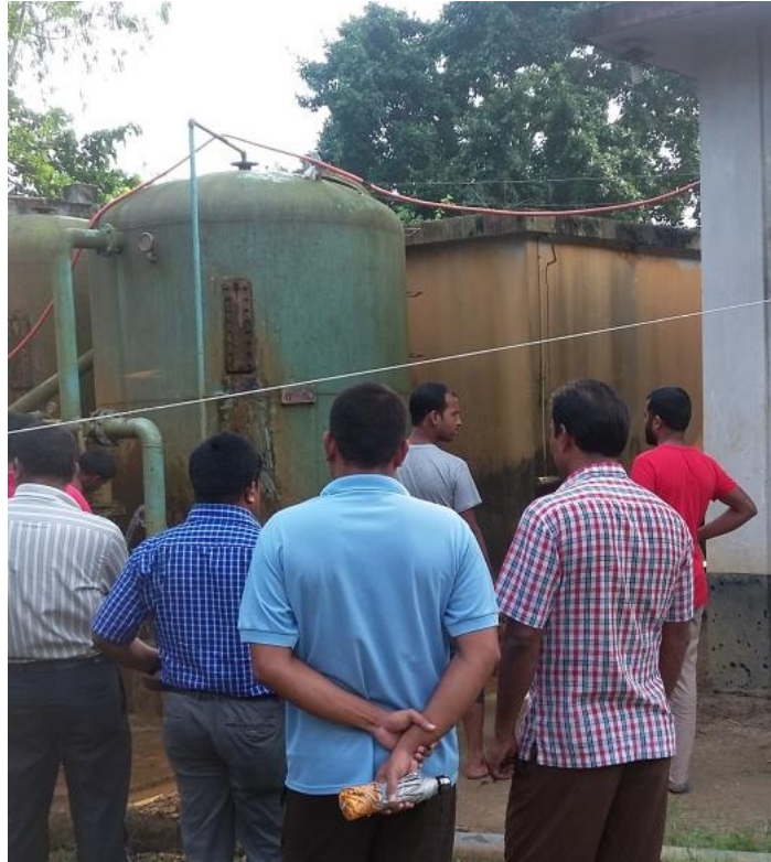
Figure 6: Field visit to Ullahpara Iron Removal Plant during hazard analysis