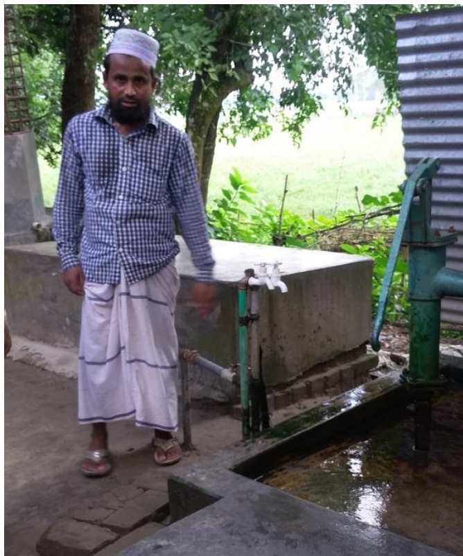
Figure 7: House connection in Ullahpara Pourashava