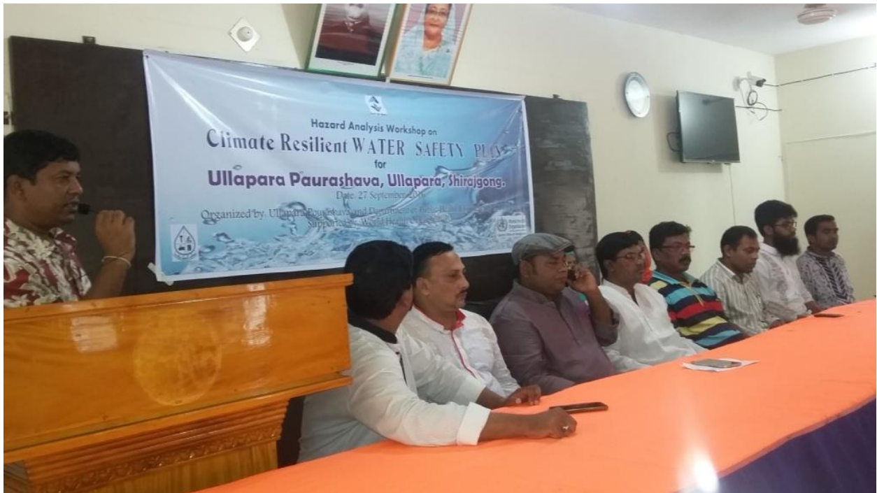
Figure 3: Opening ceremony of the hazard analysis workshop in Ullahpara Pourashava