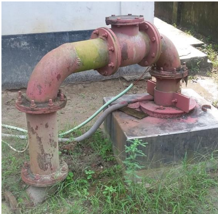
Figure 5: Production tube well of Ullahpara Pourashava water supply system