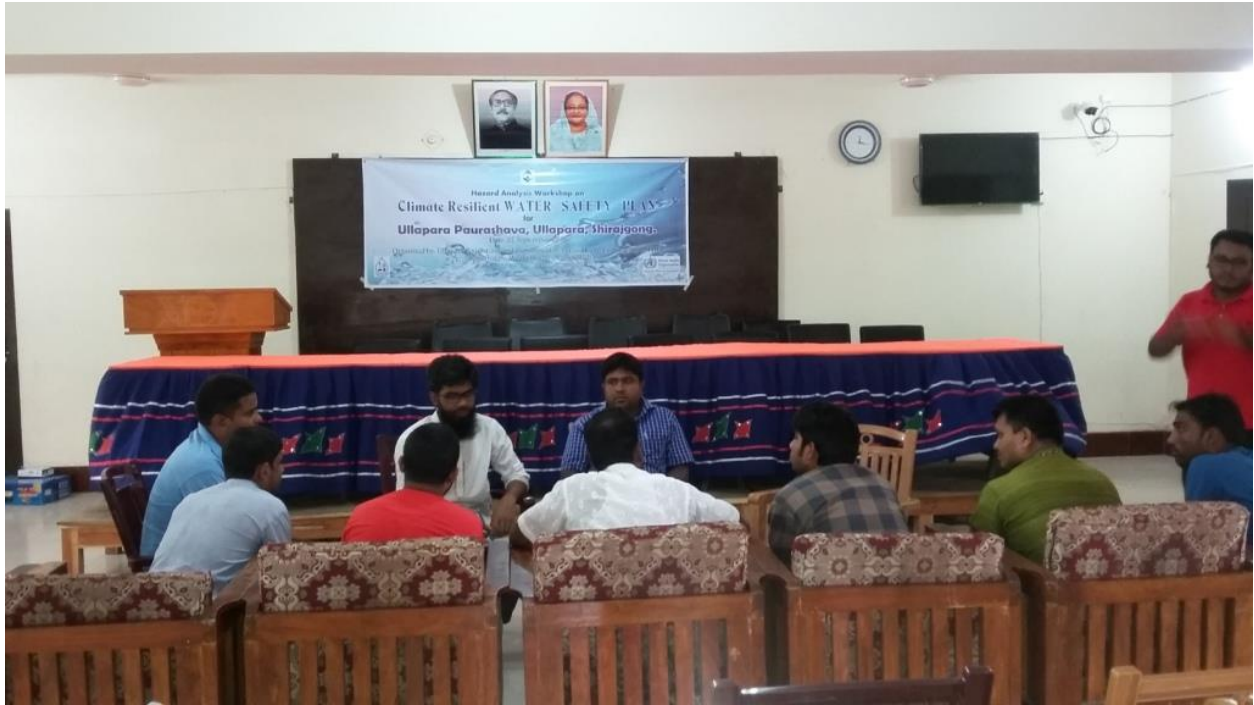
Figure 2: Discussion with water supply section staff during hazard analysis workshop