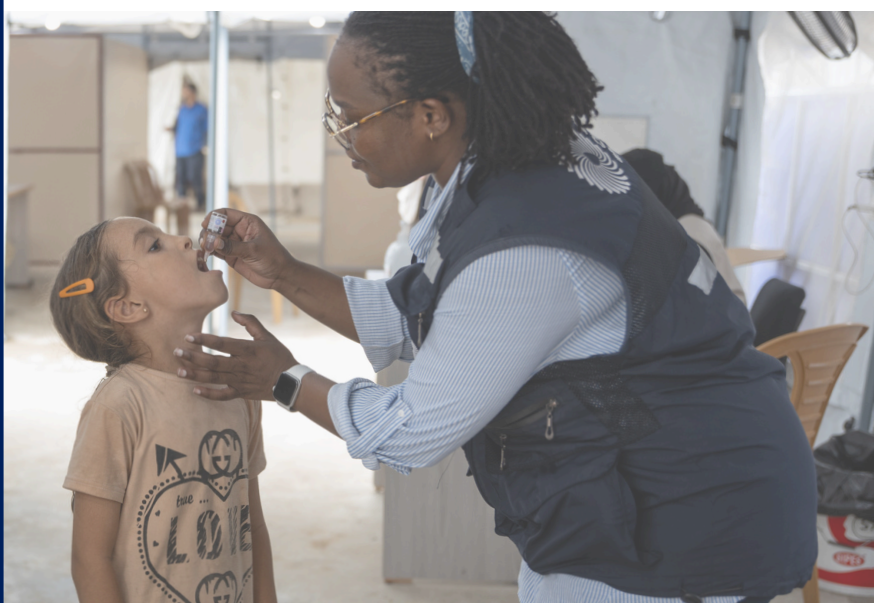
Photo: Polio vaccination campaign in Gaza in 2024.

This SBP assignment was funded by UK FCDO and deployed by CANADEM