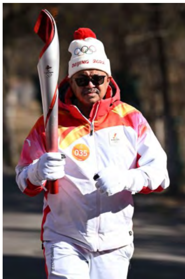
Dr Tedros braves the cold to participate in the Torch Relay during the opening ceremony of the 2022 Winter Olympic Games in China.

strengthen collaboration between the IOC and WHO, notably to promote vaccine equity and healthy lifestyles. During his visit to China, the DG met with Li Keqiang, Premier of the State Council of the People's Republic of China, to discuss Covid-19 and the need for an aggressive effort to vaccinate 70% of all populations.