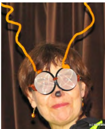
HRP Xmas Party 2010 – Theme: Endangered or Exotic Animals. The happy queen bee – so well disguised we are unable to identify her, can you help?