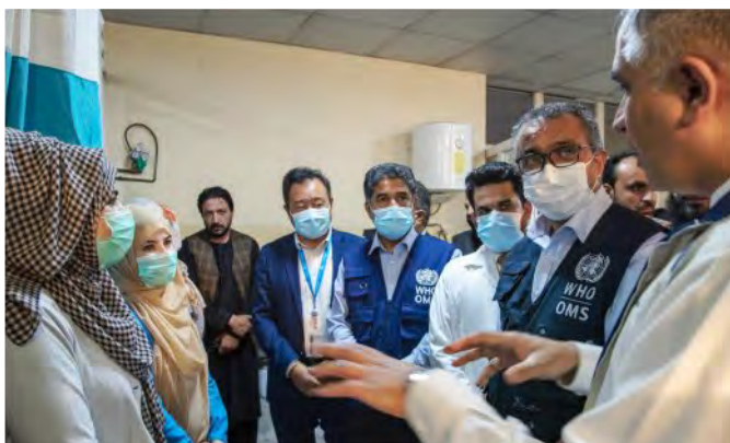
Dr Tedros visiting Kabul in September 2021 as part of his drive for a stronger WHO.