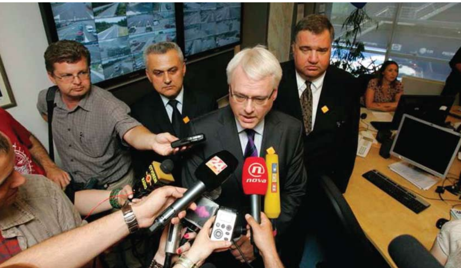
Media world-wide covered the launch of the Decade. Photographed here is President Ivo Josipović of Croatia speaking with the media on the occasion of the launch of the Decade in Zagreb.

“For far too long, roads have been planned and built with one vital element forgotten: the people they should be designed to serve”