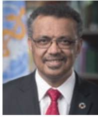
DR TEDROS ADHANOM GHEBREYESUS Director-General @DrTedros

The power of momentum: what is next on the trajectory towards gender equality THURSDAY, JUNE 6 1:30pm – 2:30pm