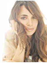
Mia Maestro (Introduction in Better Health and Well-being category)

of WHO's strategy on innovation to accelerate impact on health. Its main goals are to match the country's health needs with assessed, ready-to-scale innovations and to harness a culture of innovation in health in WHO and countries.