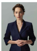
Emilia Clarke (Introduction in the UHC category)