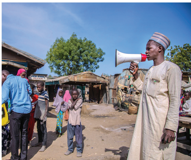
Major, long-term U.S. investments helped WHO's Africa region receive polio-free certification in 2020. Above, a polio vaccination campaign in Nigeria in 2019.

With U.S. help, polio is poised to become the second human disease, after smallpox, to be eradicated.