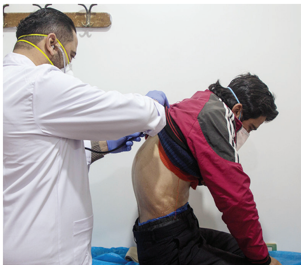
WHO is working with partners to end TB. Over the past decade, USAID has contributed US$ 101 million to WHO's Global Tuberculosis Programme. Above, a doctor examines a TB patient in Syria in 2020.

In 2021, WHO launched an initiative that collects, reports and visually presents TB data from more than 100 countries to gauge the effect of COVID-19 on progress against TB.