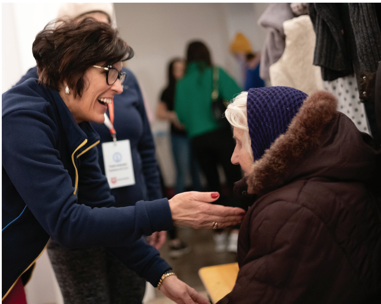
A Ukrainian refugee receives health assistance in Poland.

When health systems in Iraq, Libya, Nigeria, Sudan, Yemen and elsewhere have been ruptured by conflict or stretched to their limits by a disease outbreak, BHA's funding has bolstered WHO's work to strengthen health care capacities and provide urgent medicines and supplies .