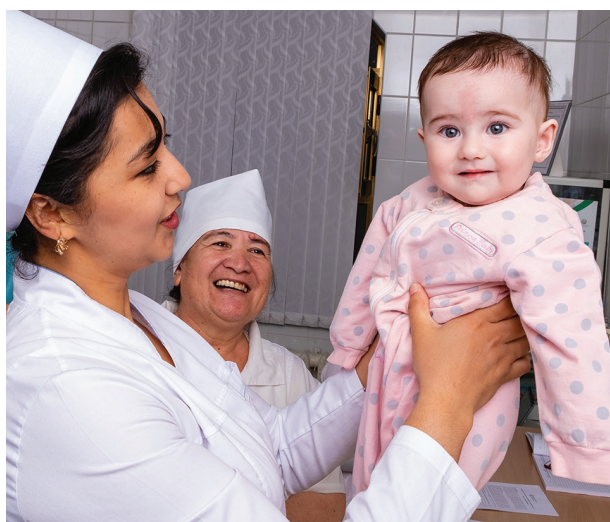
Maternal and child health are among the USA's global health priorities. Above: A routine immunization in Uzbekistan.