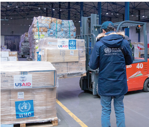
Vaccines donated by the United States arrive in Vietnam.

The USA is also fully aligned with WHO in efforts to protect human health and the environment .