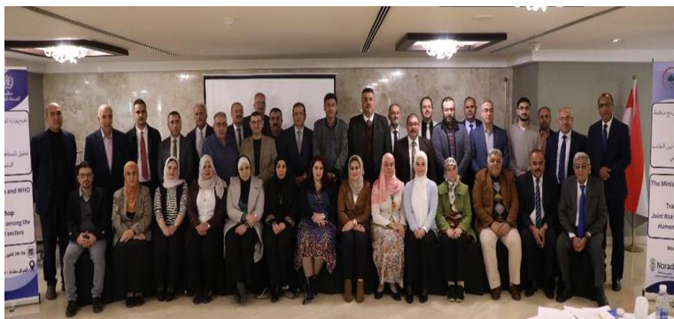
WHO, Iraq, 2023

The JRA workshop in Iraq was held in Baghdad from 26 to 28 December 2023 as a collaborative effort between the WHO Regional office, WHO country office and the national ministries of public health, animal health and environment. During the workshop, 39 staff from the national and subnational offices responsible for animal health, public health, and the environment learned about and practiced using the JRA tool for assessing risks associated with Brucellosis, Rabies and CCHF using real data, and facilitated by the WHO regional staff (One Health and Food safety technical officers).