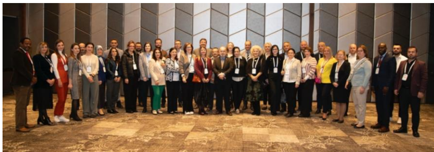
WHO, Türkiye, 2023

On 28 to 30 November 2023, WHO EURO in cooperation with UNEP and WOAHA conducted the Joint sub-regional workshop on public and animal health surveillance and control of viruses with epidemic and pandemic potential at the human-animal interface in Istanbul, Türkiye.