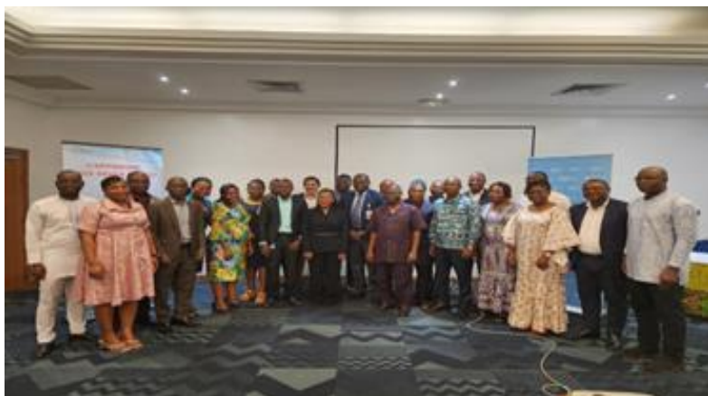
Benin Ministry of Health, Benin, 2023

In 2019, Benin has conducted the NBW during which national participants developed a joint roadmap, made of 15 objectives and 45 activities to be implemented to strengthen the coordination, collaboration, and communication to effectively address health threats at the human-animal-environment interface. Initially over 80% of these activities were planned to be implemented before 2022 using the fund provided under the Regional Disease Surveillance Systems Enhancement (REDISSE) project. In this regard, a follow up workshop was organized in Benin on 20 to 24 November 2023 to update the roadmap and identify the bottleneck and propose solutions to