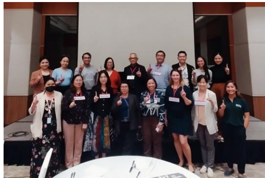
WHO, Philippines, 2023

The only documented Nipah virus outbreak in the country was in 2014 which involved infected horses, but remained inconclusive regarding the original virus source. Jointly, relevant Philippine institutions and ministries from the human, animal and environment sector assessed the likelihood and impact of different future scenarios in the country and explored risk management options. Another major outcome of the workshop was the identification of data needs for future assessments.