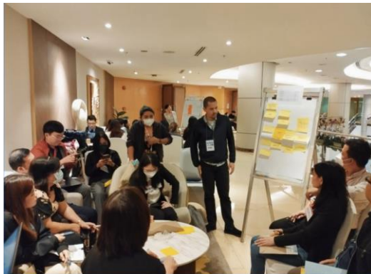
WHO, Philippines, 2023