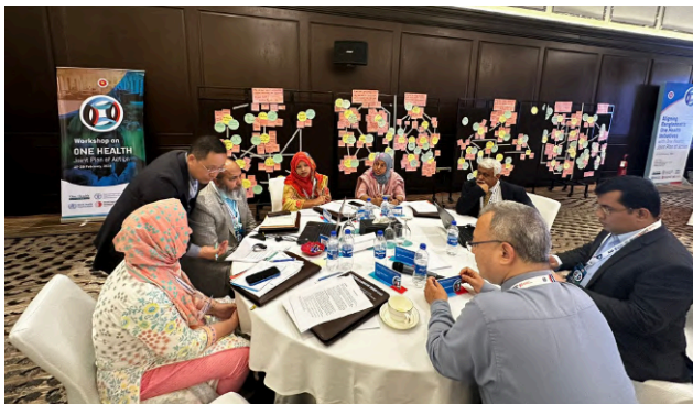
WHO Bangladesh, Bangladesh, 2024