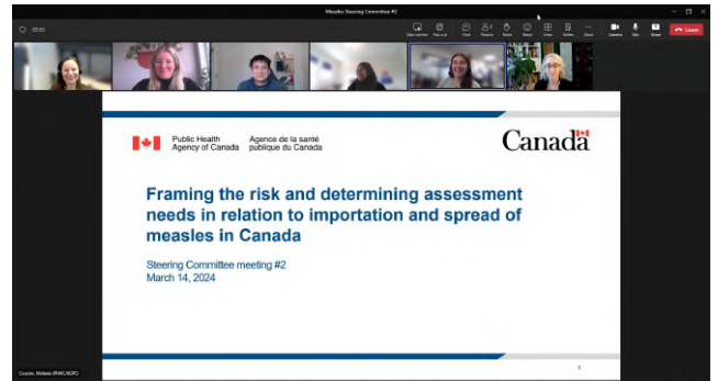
SIIRA, Public Health Agency of Canada, Canada, 2024

The Public Health Agency of Canada's new Centre for Surveillance, Integrated Insights, and Risk Assessment (SIIRA) has adapted the Tripartite Zoonosis Guide's Joint Risk Assessment (JRA) Operational Tool as a cornerstone for its infectious disease risk assessments, owing to its adaptability, comprehensive guidance, and scientific integrity. In Canada, the collaborative JRA methodology underpins SIIRA's rapid risk assessment strategy for infectious diseases and aligns with the One Health Approach to Risk Assessment framework, a collaborative effort between SIIRA and partners across One Health sectors.