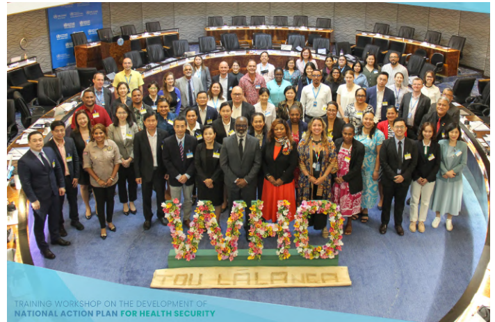
DSE/WHE WPRO, Philippines, 2024

The WHO in the Western Pacific Region organized a training session spanning from March 12 to 14, 2024, aimed at enhancing health security capabilities of countries and territories within the region. Over the course of the workshop, delegates from 12 Member States (Cambodia, the Lao People's Democratic Republic, Malaysia, Mongolia, Palau, the Philippines, Samoa, Tonga, Vanuatu, and Viet Nam) engaged in practical exercises utilizing the NAPHS method.