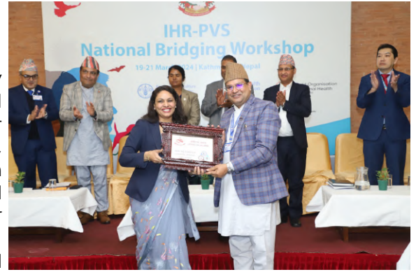
WHO Nepal, Nepal, 2024

The critical gaps identified during the workshop form the basis for institutionalizing and strengthening the implementation of the One Health approach at national level.