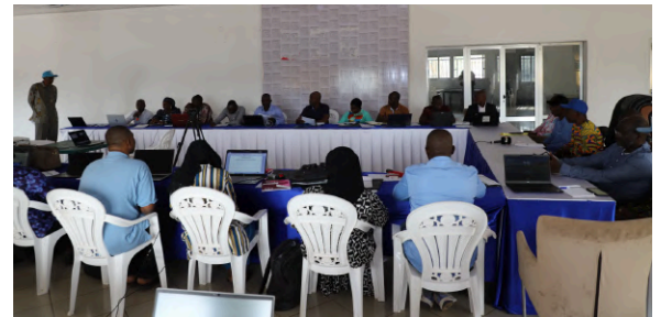
@Telyafallo, Guinea, 2024