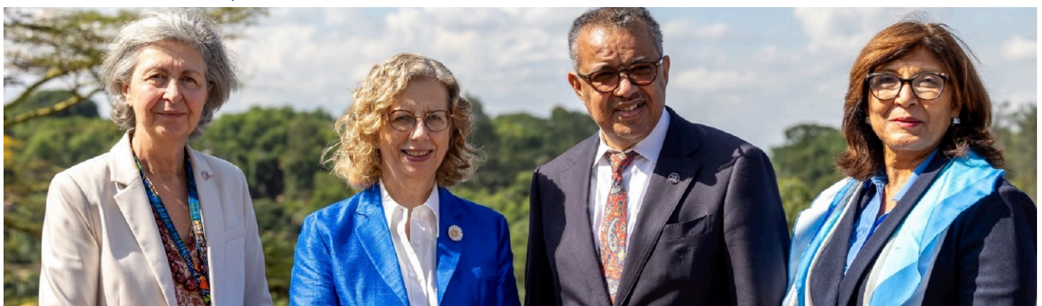
WHO Kenya/Geena Pint, Kenya, 2024

The NBW Program , Tripartite Zoonosis Guide , and other existing One Health Operation Tools were discussed in detail during the meeting, highlighting their value added towards operationalizing One Health at national and subnational levels. Also discussed and emphasized during the meeting was the need for guidance on selection and use of One Health operational tools.