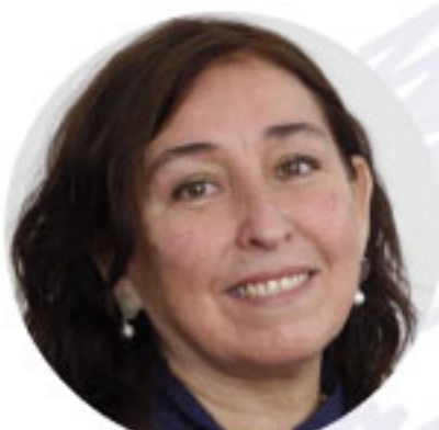
Roundtable panelist Dr MARIA BEGONA YARZA Minister of Health, Chile