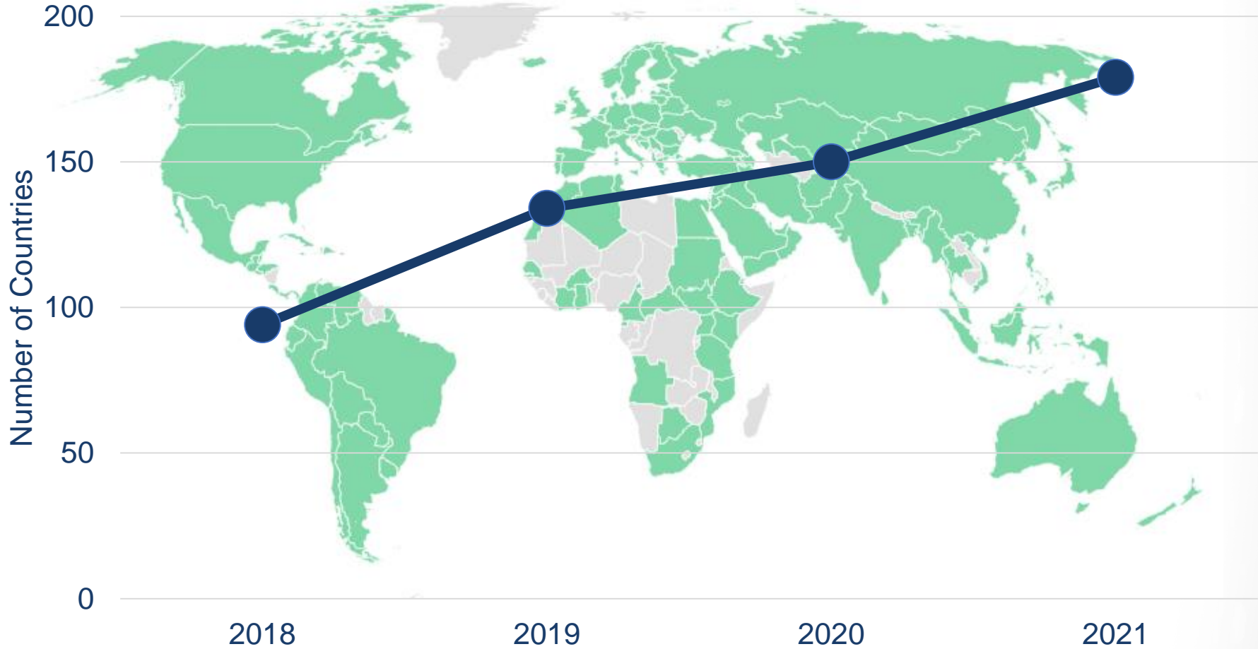
GMDN membership by user country