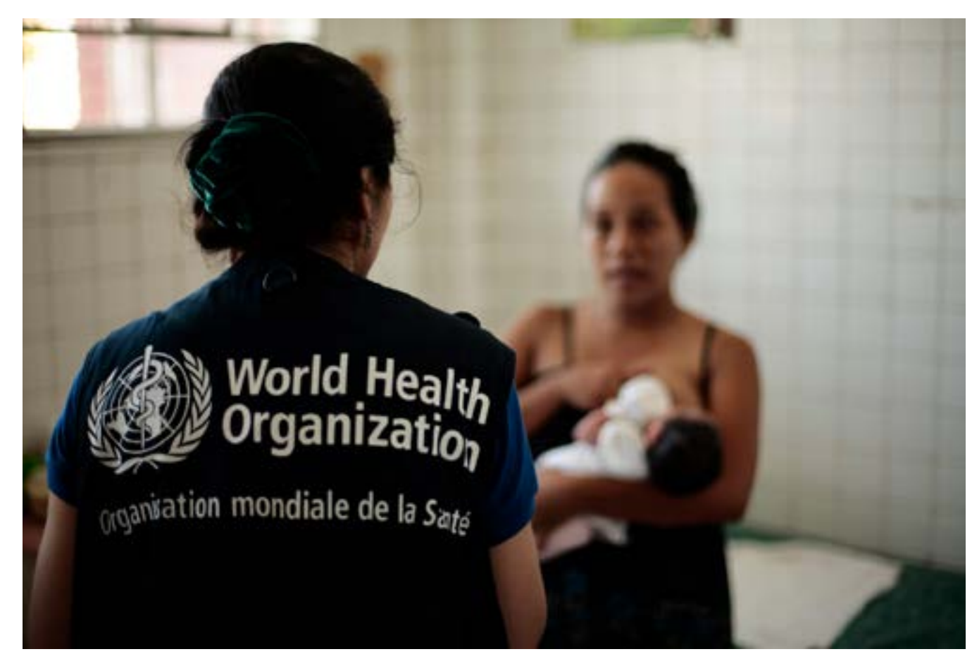
Daangbantayan District Hospital in the Philippines in December 2013, following Typhoon Haiyan in early November of that year

The findings from this review were presented and discussed at a series of regional WHO workshops (EMRO, EURO, SEARO) and at a SIDS ministerial conference, (42) and were triangulated with the initial findings of emergency operational reviews focusing on NCDs (Yemen, Ukraine, Moldova). The final set of key lessons and recommendations that emerged from this process are presented here, structured around the core components of the WHO HEPR framework, (59) with examples drawn from country case studies. The accompanying recommendations cover strategic actions that are relevant to those working in health systems strengthening, disaster risk reduction, and in preparedness and response to emergencies.