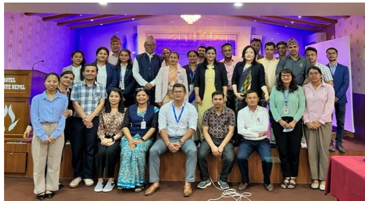
Group photo session after dissemination of IPC Guideline

health facilities to implement good IPC practice to strengthen quality health services and engaged participants from Health Directorate, Provincial Health Emergency Operations Centre, Provincial Public Health Laboratory, Human Resources Development Center, Ministry of Social Development, Province Hospital Surkhet, district and private hospitals of Karnali province.