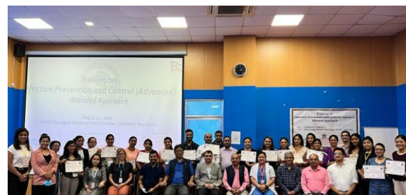
Group Photo session completion of the training on “Infection Prevention and Control”