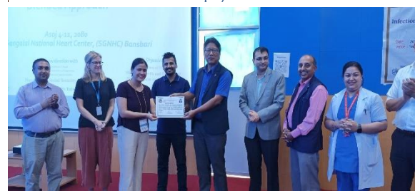
Certificate of completion of the training on “Infection Prevention and Control”