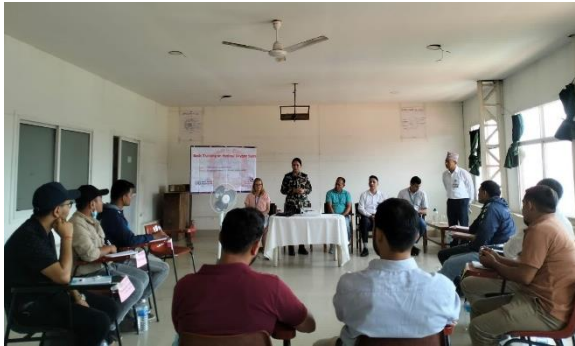
Briefing session at the plant site during the training on “Basic Training on Medical Oxygen System”