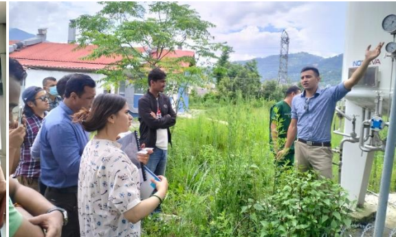
Session on handling and general safety during the training on “Basic Training on Medical Oxygen System”