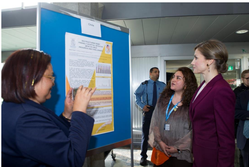
Queen Letizia Ortiz Rocasolano of Spain discusses poster presentations with Congress participants.

Participants had numerous other opportunities for learning and networking. Regional groupings of countries met twice during the Congress to enable cooperation among countries and commit to supporting implementation and follow up after the BFHI Congress. An evening reception, breaks and lunches allowed participants to interact informally. Thirty countries presented posters on BFHI implementation, compliance with the Code, certification processes and contextual adaptations.