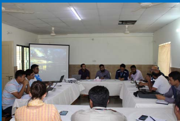
Meeting to map needs and gaps at Ukhia Health Complex Hospital, (14 August 2018)