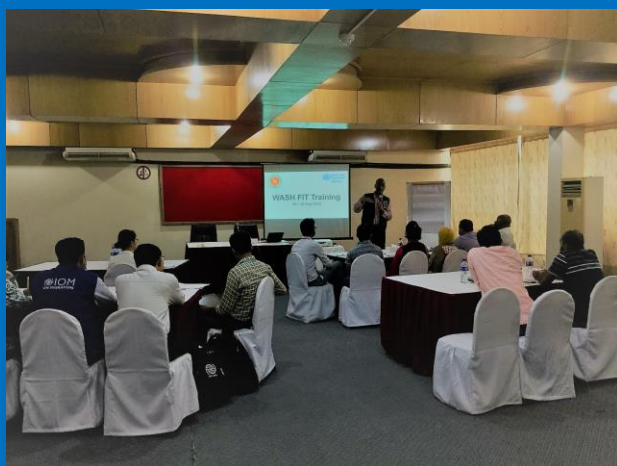
WASHFIT training in Cox's Bazar (28-30 August 2018)