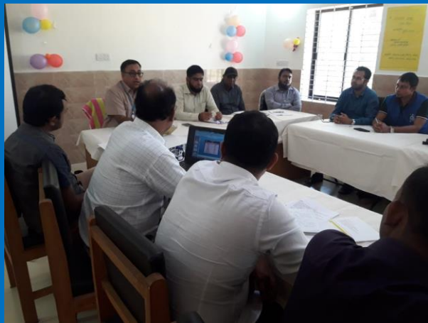
Partner coordination meeting in Ukhiya Complex Hospital