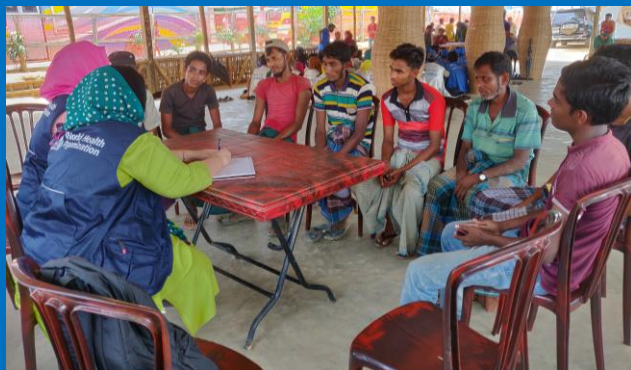
Focus group discussion with Rohingya refugee men on betel nut consumption.