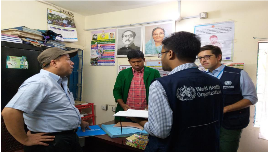
Field visit with the mission from Embassy of Japan in Bangladesh, on 17 June 2019.