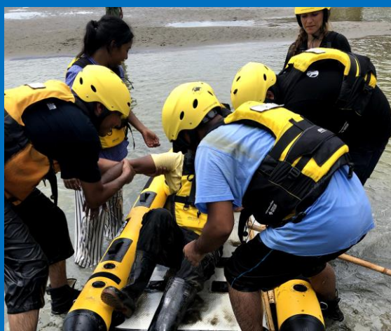
Mobile Medical Team(MMT) training- 26 June 2019