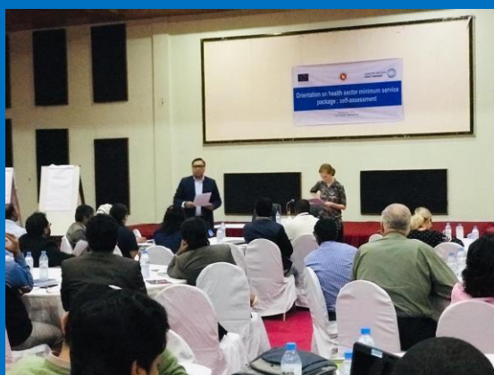
Health Sector Training on Minimum Service Package and Self-assessment- 22 nd January 2019