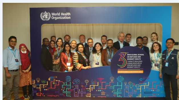
WHO staff in the frame

A five-day 3rd Global School on Refugee and Migrant Health 2022 has been organized by WHO HQ in Dhaka from 28 November to 2 December. This year the focus was on Capacity-Building for the human resources providing health services for Refugee and Migrant health needs and rights. The Global School provides UN agencies, NGOs, health-sector partners, and academics a platform to learn about critical health topics.