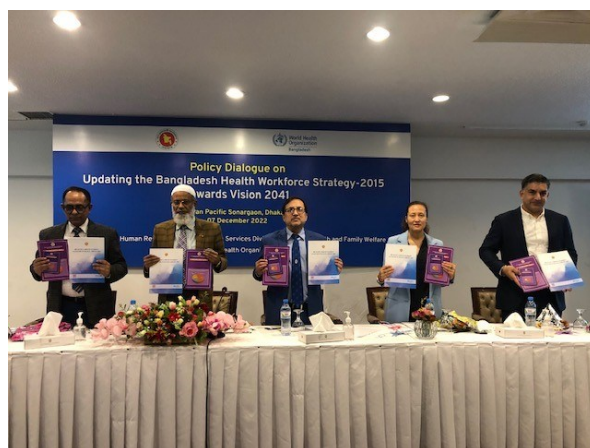
Event guests are with strategy