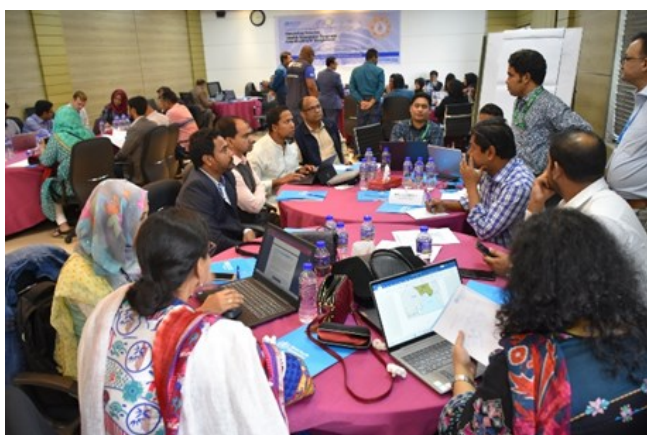
Participants are in the simulation, Photography: WHO staff

A tabletop exercise was held in Bangladesh from 13-15 December 2022 titled "Simulation Exercise for emergency response coordination in Bangladesh." The purpose of the exercise is to strengthen coordination among sectors responsible for disaster management and infectious disease outbreak, including relevant stakeholders and the role of the HEOC/PHEOCs for better preparedness and response.