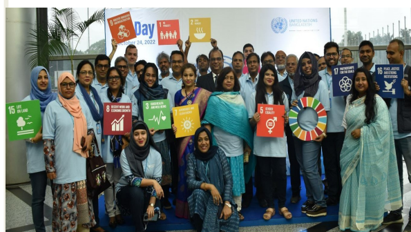
WHO staff

WHO Bangladesh's staff celebrated UN Day on 24 Oct 2022, along with other UN agencies in Bangladesh. WHO Bangladesh is proud to work hand in hand towards building peace and security with good health and well-being by promoting international cooperation. UN Day, celebrated every year, offers the opportunity to amplify the common agenda and reaffirm the purposes and principles of the UN Charter that have guided for the past 77 years.