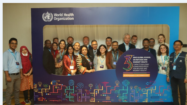
WHO staff in the frame

A five-day 3rd Global School on Refugee and Migrant Health 2022 has been organized by WHO HQ in Dhaka from 28 November to 2 December. This year the focus was on Capacity-Building for the human resources providing health services for Refugee and Migrant health needs and rights. The Global School provides UN agencies, NGOs, health-sector partners, and academics a platform to learn about critical health topics.