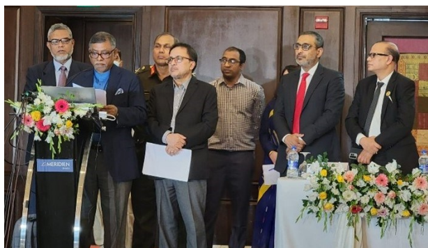
AAW 2022

On World Antimicrobial Awareness Week 2022, with the support of WHO, CDC organized a national-level advocacy meeting with quadripartite stakeholders and the representatives of different relevant departments of the Bangladesh Government. The meeting emphasized the importance of raising awareness of antimicrobial resistance and encouraging best practices among policymakers, health workers and the general population. The Minister of the Ministry of Health and Family Welfare, Mr. Zahid Maleque MP, was the chief guest at that meeting.