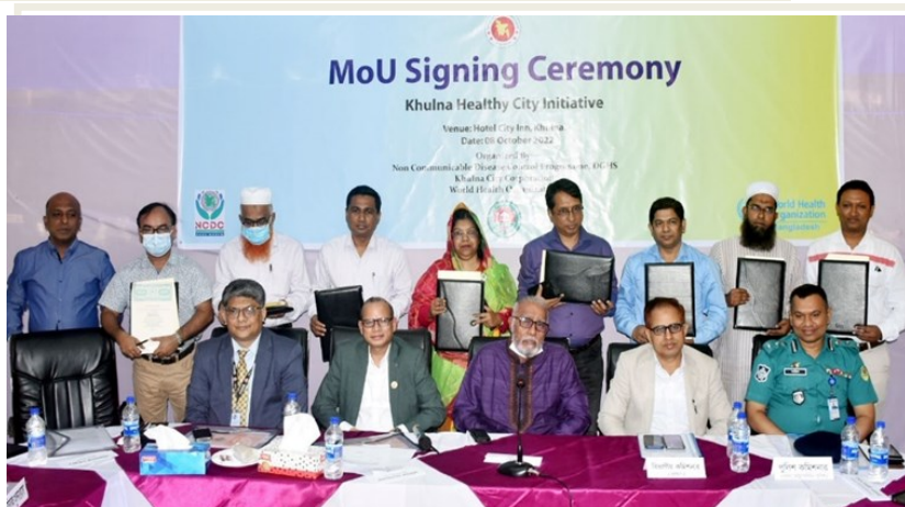
Event guests are in the frame