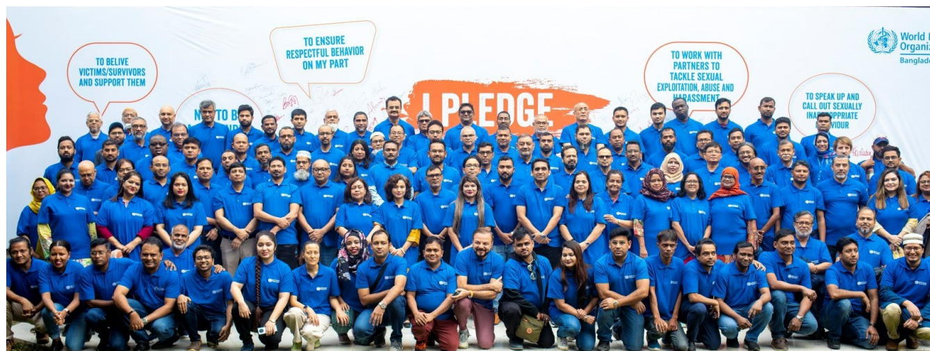
WHO staff, Photography: external photographer

WHO Bangladesh conducted a staff retreat in Bogura between 16-19 December 2022, focusing on Prevention and Responding to Sexual Exploration, Abuse, and Harassment (PRSEAH). The outcome of this retreat aims to increase employee awareness to overcome the SEAH on a structural level and eliminate it in the long term and to enable and ensure respectful behavior in the workplace. Overall, this preventive work aims to create an equal workplace where mutual respect prevails regardless of gender, race, age, or background.