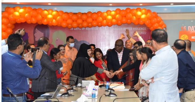
WHO staff, Photography: Salma Sultana

To show solidarity with the 16 Days activism campaign, WHO-BAN organized different activities including interactive sessions, discussions, and quiz competitions in WHO Dhaka and Cox's Bazar office in Bangladesh.