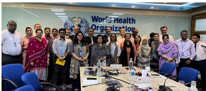
Group photo of the GEHR participants..