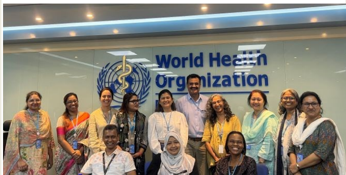
Group photo of PSEA Network Partners

In collaboration with PRS Regional advisor Bangladesh, WCO host interactive meetings with some of PSEA Network members from Dhaka on 29 th August 2023 and Cox's Bazar on 30 August 2023. PSEA Network members from UNICEF, UN WOMEN, FAO, UNESCO, UNFPA, UNDSS, UNHCR, ISCG, Humanity Inclusion (HI), RDRS, SARPV, and colleagues from WHO participated in this mutual exchange session. The meeting agenda focused on sharing experience and best practices on what as PSEA Network members do around preventing and responding to Sexual Misconduct. The PSEA Network is doing joint great work at the field and its PSEA work plan is aligned with organizational PRSM action plan.