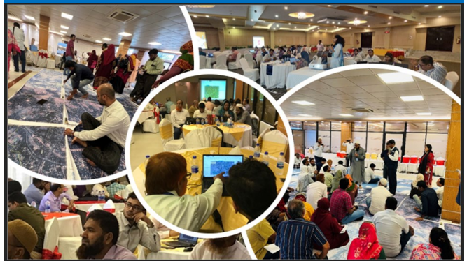
Glimpse of training; Photo: Dr Nusrat, Dr Faisal, and Md Azim, WHO

The WHO proposed a national EPI to introduce innovative technology like geographical information system (GIS) in the EPI program to strengthen the immunization system in terms of mapping, microplanning, supervision, and monitoring. GIS provides the highest possible support in mapping the equitable distribution of vaccination sites, disease outbreaks, and trends with accurate geospatial data in context to catchment areas, such as high-risk and hard-to-reach, slum population, distance from health facility to service delivery points, etc. Read more