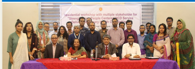
Group photo of the invitee of the workshop.