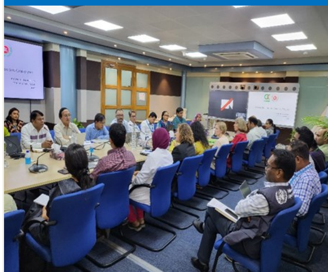
Participants of the Health Cluster Meeting.