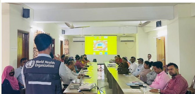
Participants of the advocacy session.

The WHO Bangladesh played a pivotal role in the "The Big Catch-Up" advocacy initiative in the Khulna division. This included raising awareness among healthcare providers, community leaders, and parents about the importance of child immunization. Advocacy efforts aimed to dispel vaccine hesitancy, promote the benefits of vaccination, and highlight the role of vaccines in preventing devastating diseases.