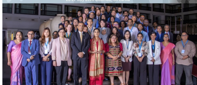
Group photo of joint risk assessment meeting.

Advancing joint risk assessment using One Health approach in WHO South-East Asia Region 25-27 July 2023 Colombo, Sri Lanka