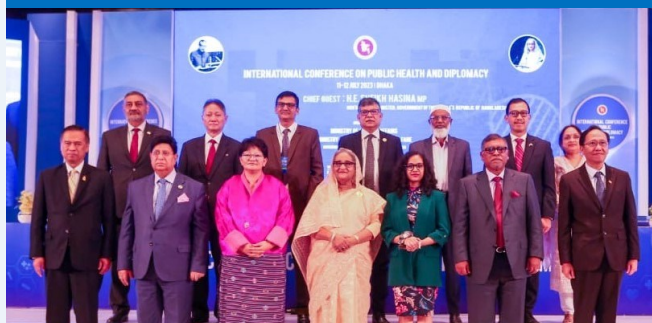
The Hon'ble Prime Minister with delegates, dignitaries from Government and UN organization.

A two-day International Conference on Public Health and Diplomacy, organized by the Ministry of Foreign Affairs and the Ministry of Health and Family Welfare, has been convened to mark the 75th anniversary of WHO. The Conference was organized in collaboration with the WHO Country Office, with participation from WHO HQ and regional office. Hon'ble Prime Minister of Bangladesh graced the opening ceremony as the Chief Guest. Hon'ble Foreign Minister, Minister of Health and Family Welfare, and Health and Foreign Ministers from the WHO South-East Asia region also joined the event. In her statement, the Hon'ble Prime Minister expressed her determination to ensure universal health coverage in Bangladesh. She also called upon the global community to ensure that WHO can play central role in global health governance to serve humanity in next 75 years and beyond.