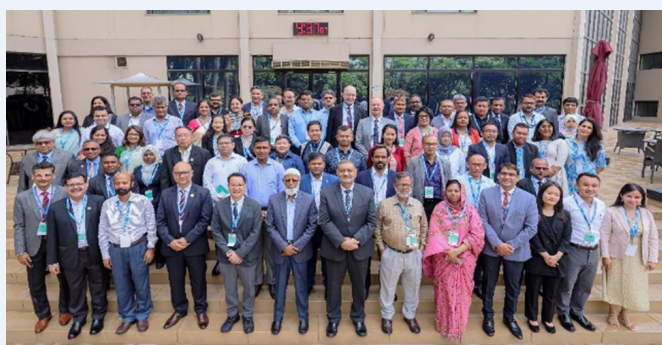
Group photo of the SEA Regional PHC Forum.