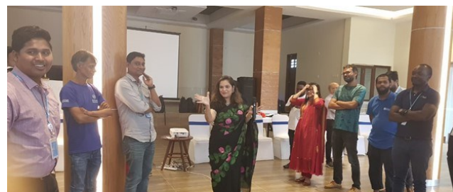
Group exercise by the participants.

The World Health Organization Sub Office (WSO) held a staff orientation and refresher training on Prevention and Response to Sexual Misconduct (PRSM) at the Dera Resort in Cox's Bazar on September 14, 2023. The event saw the participation of more than 46 staff members from WSO and 07 attendees who joined online.