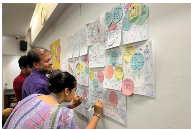
Individual participation in the exercise.

A two-day training on basic photography and branding & visibility was held at the BRAC CDM, Saver, on 26-27 July 2023. NPO communication WHO designed this orientation to give a basic understanding of photography and WHO branding & visibility. There are 18 internal staff from different technical teams of WHO Bangladesh joined the training. The training objective was to explain the basics of photography, especially mobile photography, organizational branding, and visibility, capture photos, maintain the basic rules of photography, and ensure proper branding and visibility for the organization.