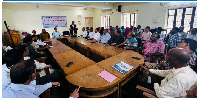
SIMO, Sunamganj conducting the session.

In Bangladesh, school teachers have emerged as crucial supporters of the health sector, especially in rural and underserved areas. They organize health education sessions, conduct awareness campaigns on hygiene and sanitation, and even assist in vaccination drives.