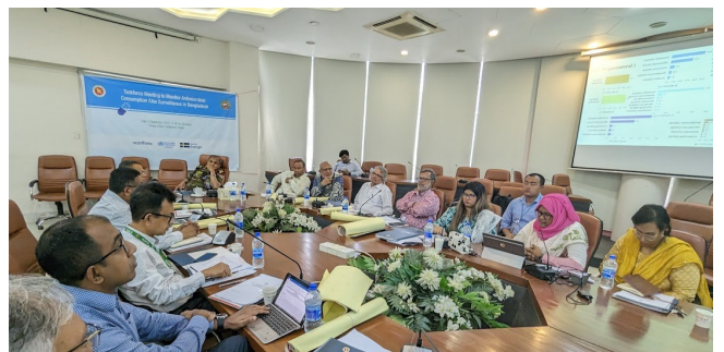
Participants are in plannery discussion. Forum.

A task force meeting was conducted to monitor Antimicrobial Consumption/Use (AMC/U) in Bangladesh on 3 September 2023. The meeting was presided over by DGDA's Director General and gathered recommendations from key stakeholders, including CDC, IEDCR, DLS, BLRI, BSMMU, DOF, FAO, USAID, USP-PQM+, BHB, Fleming Fund Bangladesh Country grant, and WHO Bangladesh. The stakeholders reviewed the AMC surveillance report for 2021 and provided their feedback on the National Guideline on Dispensing, Use, and Disposal Management of Antimicrobial Drugs in Bangladesh. Additionally, the meeting addressed the Standard Operating Procedure (SOP) for AMC Surveillance in veterinary medicines, and awareness materials developed in collaboration with WHO Bangladesh for World AMR Awareness Week (WAAW) 2023. The task force members commended DGDA's work approved the AMC surveillance report for 2021 and recommended forming a working group to identify the reasons behind the high consumption of antimicrobial drugs and make necessary policy changes.