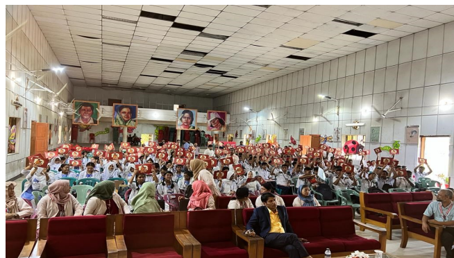
Participants of the advocacy session..

WHO BAN and DGDA's commitment extended to AMR awareness among youth and school-going children. A school-level awareness program was held in September 2023, where the Directorate of Secondary and Higher Education (DSHE) and the National Institute of Preventive and Social Medicine (NIPSOM) also collaborated with WHO and DGDA to play a vital role in motivating the students. In that program, distributing informative comic books, an Art competition on AMR, and an experimental study demonstrated positive impacts. An antibiotic coloring book, "The Invention of Penicillin," was introduced to engage and educate children effectively. DGDA also transformed the popular comic book "Tinu-Minu and Super-Bug" into an animated version scheduled for launch during World AMR Awareness Week in 2023.