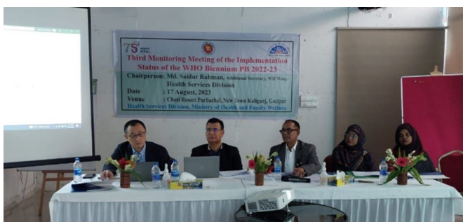
Chief guest and other guests are on the dais.