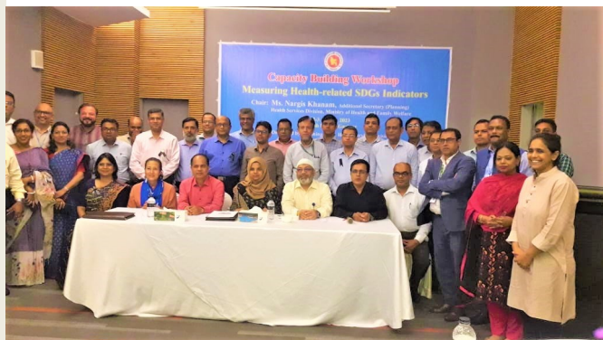
Participants of the capacity building workshop.