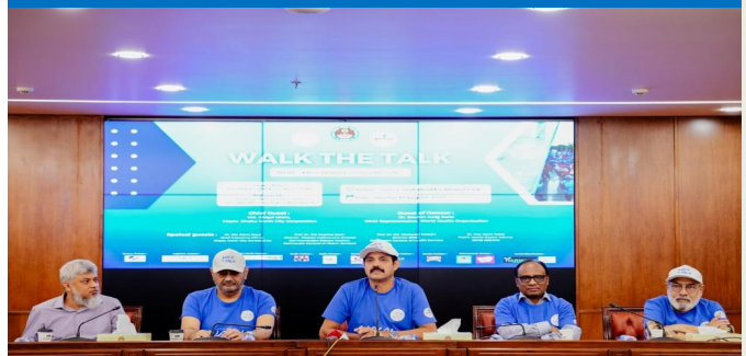
Guests are on the dais

On 13 August 2023, Bangladesh embarked on a journey that will leave a mark on the pages of history, inspiring generations and brilliance to meet passion to transform the dreams into reality.