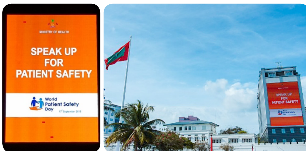
Posters produced by the Ministry of Health were seen around the country.

Billboards across the country featured posters and GIFs produced by the Ministry of Health. These messages raised awareness of patient safety and this year's theme, "Speak up for patient safety!"