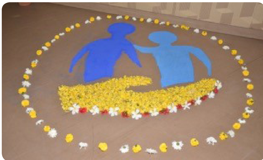
World Patient Safety Day-themed Rangoli at Hamdard Institute of Medical Sciences, New Delhi

Several Ministries of Health hosted public events, workshops, and conferences to bring stakeholders together in honour of the day (Bangladesh, Bhutan, India, Myanmar, Nepal, Sri Lanka, Thailand). Timor-Leste's Ministry of Health commemorated World Patient Safety Day with a "Walk the Talk" event.