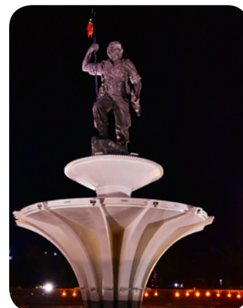
Monuments lit up in orange in Dili, Timor-Leste.