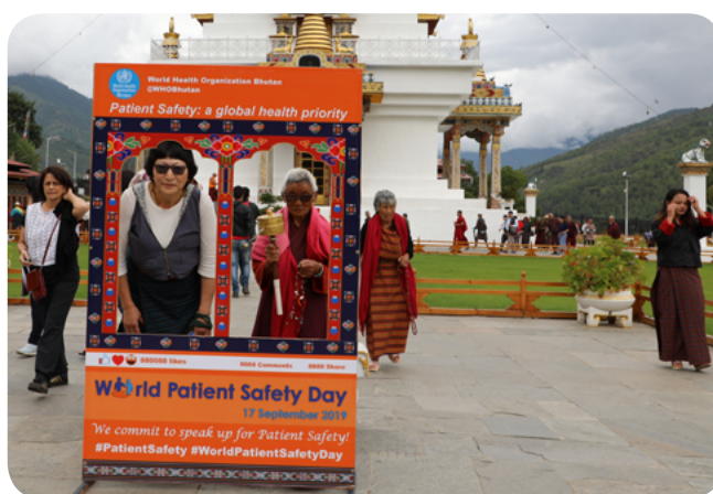
Marking World Patient Safety Day through a social media campaign.