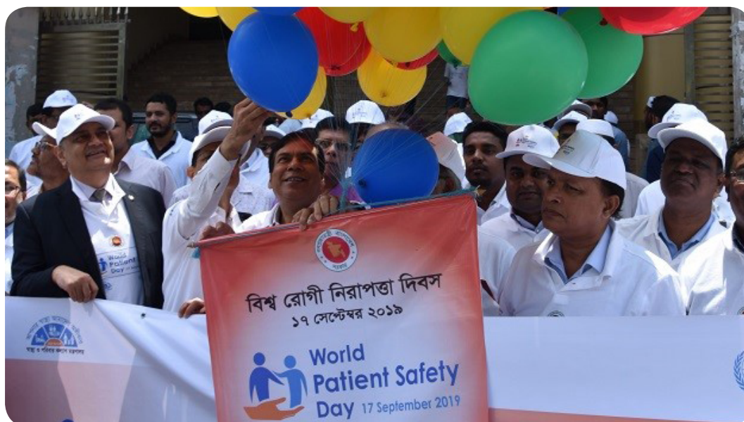
World Patient Safety Day Activities in Bangladesh.

The new building for the Directorate General of Health Services and some hospitals were lit up in orange.