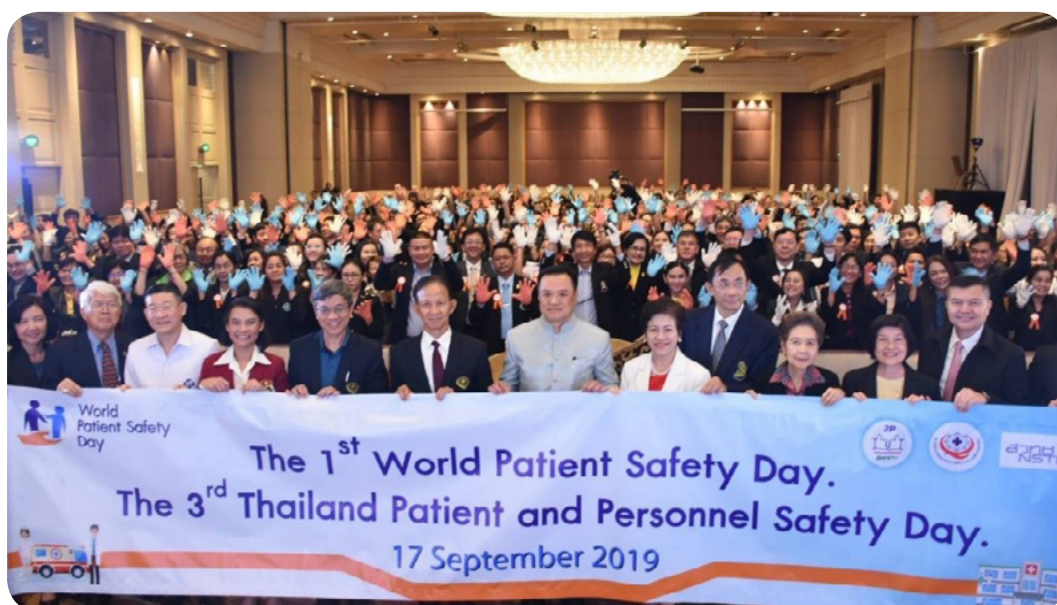
Participants at the Patient and Personnel Safety Workshop in Thailand.

Over 800 people attended a two-day workshop on Patient and Personnel Safety in Thailand. All aspects of patient and personnel safety were promoted, including information on patient and personnel safety strategies, best practices and the national policies, goals and reporting and learning system.