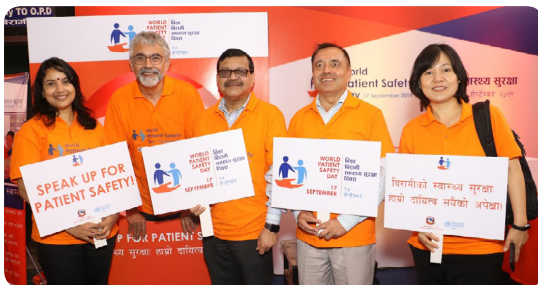
Participants at the World Patient Safety Day celebration at the Trauma Center, Kathmandu, Nepal

The opening event for World Patient Safety Day at the Trauma Center in Kathmandu engaged hospital officials, health managers, policy-makers, public health experts and private partners on patient safety awareness and priorities.