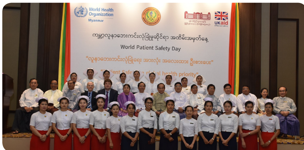
Health professionals at the celebration of World Patient Safety Day in Nay Pyi Taw.

The Union Minister for Health and Sports, the United Kingdom Ambassador to Myanmar and the WHO Representative attended the day-long celebration.