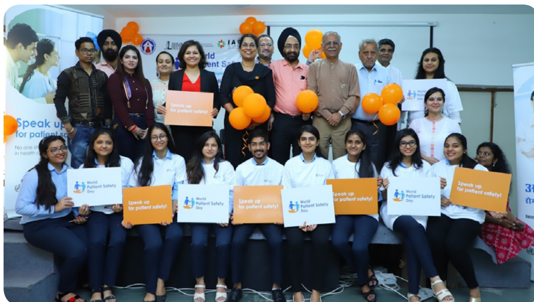
Students celebrating World Patient Safety Day in New Delhi.

Hospitals across the country strengthened the capacity of the next generation of health professionals by partnering with medical colleges to host interactive sessions and workshops. Health facility staff across the country took pledges on patient safety.