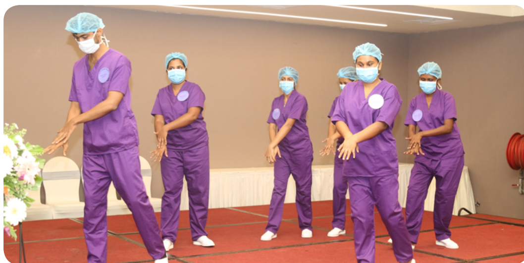
Staff from the Teaching Hospital Karapitiya performing the Hand Hygiene Dance.

Staff from the Teaching Hospital in Karapitiya performed a colourful dance on hand hygiene during the national event.