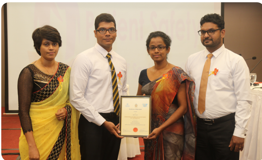
Winners of Sri Lanka's Patient Safety Quiz competition, the team from Southern Province