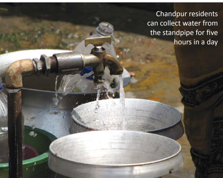
Chandpur residents can collect water from the standpipe for five hours in a day