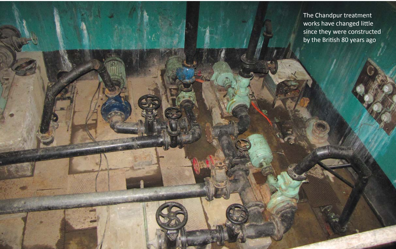
The Chandpur treatment works have changed little since they were constructed by the British 80 years ago