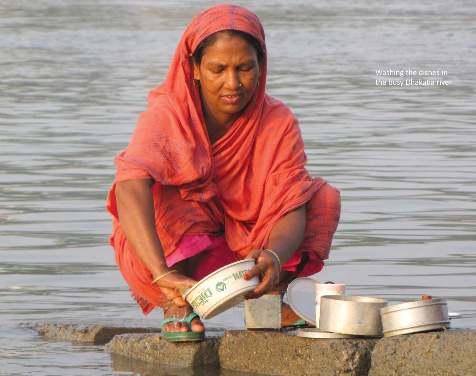
Washing the dishes in the busy Dhakatia river