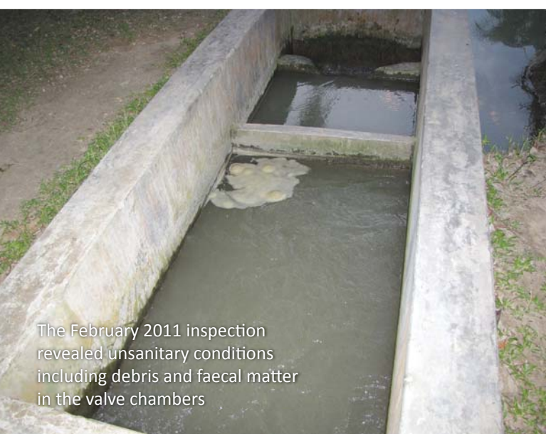
The February 2011 inspection revealed unsanitary conditions including debris and faecal matter in the valve chambers