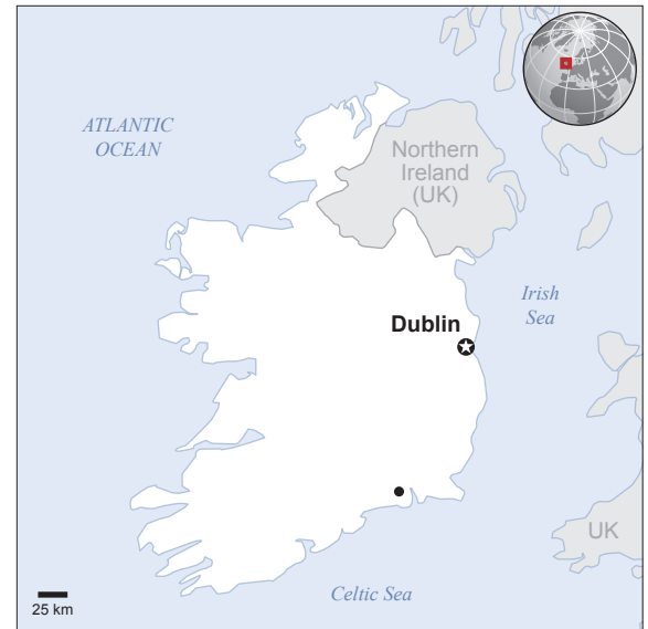
Adapted from: UNGIS, ESRI The boundaries and names shown and the designations used on this map do not imply official endorsement or acceptance by the United Nations.

With regard to natural hazards, Ireland experiences only very minor earthquakes as the island is on a passive margin of the European continental plate. Other hazards, such as sinkholes, landslides and flooding are more frequent in Ireland.