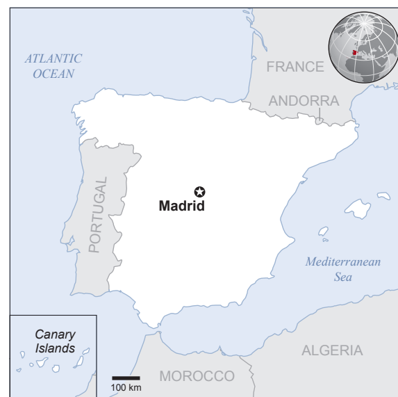
Adapted from: UNGIS, ESRI The boundaries and names shown and the designations used on this map do not imply official endorsement or acceptance by the United Nations.

Area 505 970 sq km % land below 5 meters 0.8% Coastline 7 268km